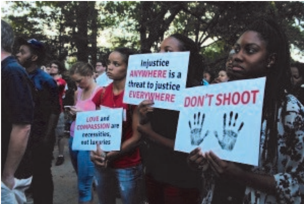
Justice for Michael Brown rally in Washington, D.C., Aug. 14.

See http://sojo.net/blogs/2014/08/21/not-helpless-we-think-3-ways-stand-solidarity-ferguson